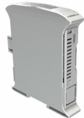
RASPBerry PI RAILBOX 22,5